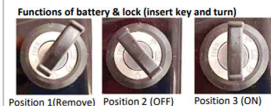
Figure B2: Positions of the key in the battery lock

Similar to a car ignition lock, there are 3 positions